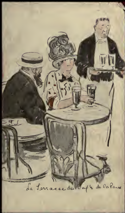
La Terrasse du Café de la Paix